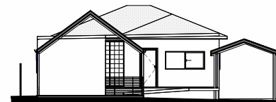
EXISTING HOUSE & PROPOSED ACCESSIBILITY RAMP