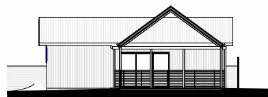
EXISTING GRANNY FLAT & PROPOSED BBQ AREA